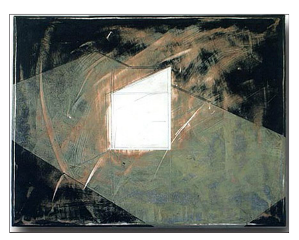
Into the Looking Glass 1–3, 2003, egg tempera, 9.25 x 12 x 1.75 inches

The George Billis Gallery marks its eighth year in the Chelsea Art District. The Gallery exhibits work by emerging and established artists. For additional information please call 212-645-2621 or email the Gallery at: gallery@georgebillis.com or visit the Gallery's web site at: www.georgebillis.com.